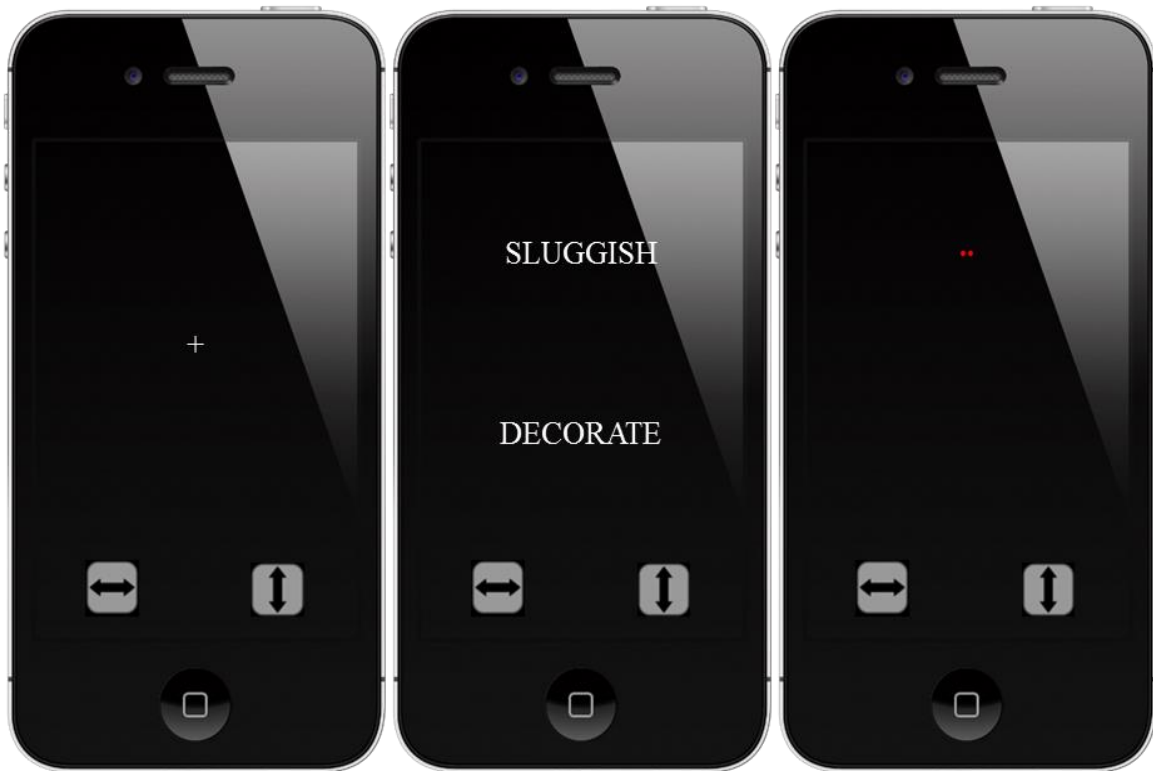
Fig 1. Example trial of the attentional probe task delivered via iPhone.

aspects with the exception that visual probes replaced threat and neutral words with equal frequency on each trial. The remaining 96 trials in each condition (4 repetitions of 24 words pairs) were attentional assessment trials where probes replaced the threatening and neutral member of word pairs with equal frequency. While a continuous block of attentional assessment trials permits a discrete period of attentional assessment, there is also the possibility that such a discrete block of trials can potentially disrupt/compromise an acquired pattern of attentional selectivity and any associated effects. As such, and consistent with the approach of a number of previous studies [e.g. 6, 7, 8] assessment trials were incorporated into the training trials by randomly dispersing the 96 attentional assessment trials in the latter half of the training trials. Reaction time data derived from the attentional probe assessment trials was prepared in a manner consistent with previous studies [9, 10]. Specifically, to limit the influence of outlying data, trials with incorrect responses (4.16% of trials) or latencies less than 200ms (0.25% of trials) or greater than 2000ms (1.52% of trials) were removed.