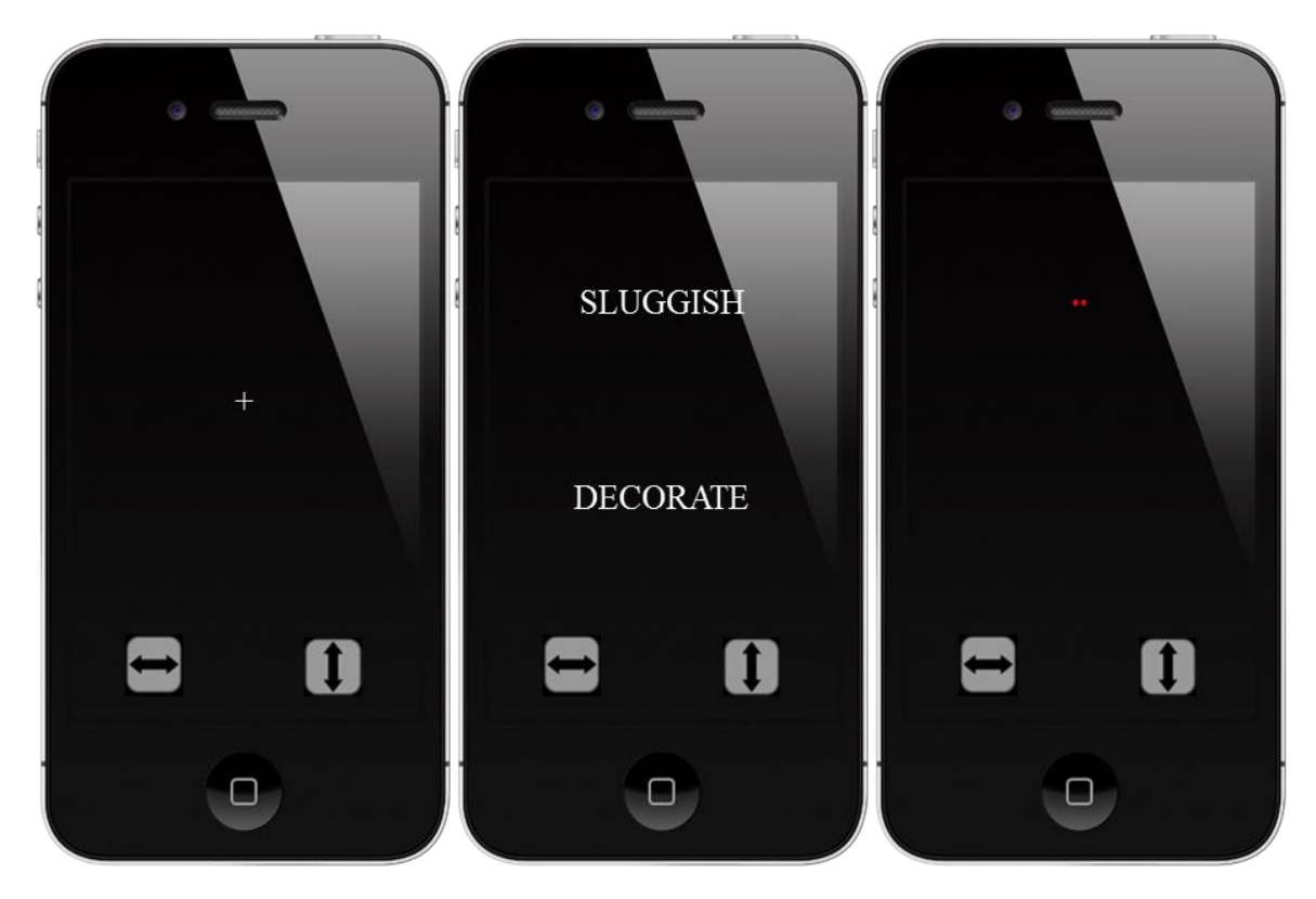
Fig 1. Example trial of the attentional probe task delivered via iPhone.

aspects with the exception that visual probes replaced threat and neutral words with equal frequency on each trial. The remaining 96 trials in each condition (4 repetitions of 24 words pairs) were attentional assessment trials where probes replaced the threatening and neutral member of word pairs with equal frequency. While a continuous block of attentional assessment trials permits a discrete period of attentional assessment, there is also the possibility that such a discrete block of trials can potentially disrupt/compromise an acquired pattern of attentional selectivity and any associated effects. As such, and consistent with the approach of a number of previous studies [e.g. 6, 7, 8] assessment trials were incorporated into the training trials by randomly dispersing the 96 attentional assessment trials in the latter half of the training trials. Reaction time data derived from the attentional probe assessment trials was prepared in a manner consistent with previous studies [9, 10]. Specifically, to limit the influence of outlying data, trials with incorrect responses (4.16% of trials) or latencies less than 200ms (0.25% of trials) or greater than 2000ms (1.52% of trials) were removed.